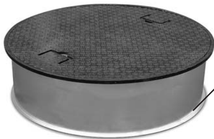
Patented Concrete Lock

Part Number - 78 Patent number 5,899,629 and 5,785,452