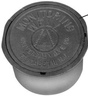
API Monitoring well designation