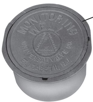
API Monitoring well designation